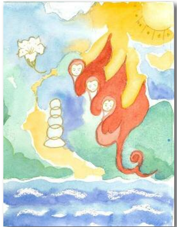
Watercolour by Hosanna. "I hope that in a small way all my paintings can celebrate the presence of God in the world."

This article first appeared in Subud World News www.subudworldnews.com