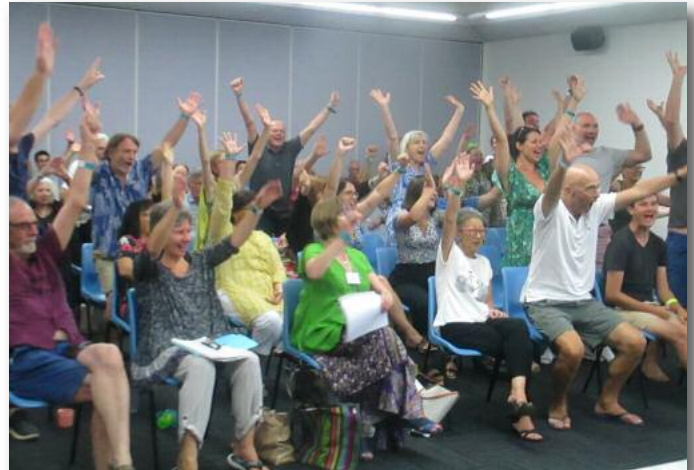
The Subud Australia Congress enthusiastically supported making a bid for Melbourne as the venue of the Subud World Congress 2022..

The Subud Australia Congress was a very happy event. It was held January 6-7 at the Currimundi Recreation Centre on Queensland's Sunshine Coast which is an excellent facility for both Congress activities and family holiday. The