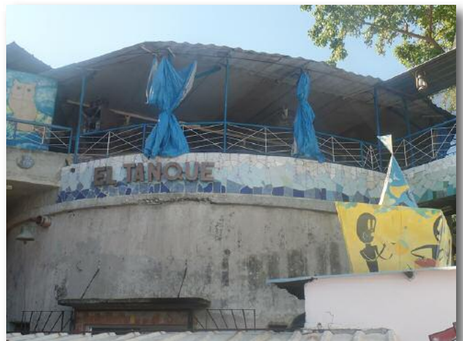
El Tanque, headquarters for the Zone 7 Youth Gathering Havana, Cuba

We had four participants from Canada, four from the US, one from Mexico, four from Colom-