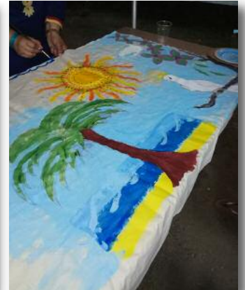
Images of fabric art workshop done by young and older Subud members during our National Congress January 2018. Some members have asked to continue working on it at the Regional Gathering in things that represents our country and culture.