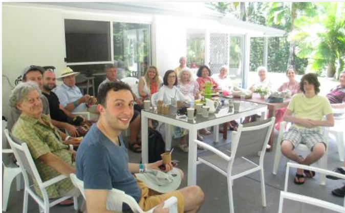
During Congress there was a visit to the nearby Sunshine Coast group.

to help her produce a long banner on which they painted Australian images and icons.