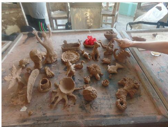
The fruits of our ceramics class at Muraleando.

bia, one from Chile and five from Cuba (who participated the whole time, though many came to do latihan with us in the mornings). As always, the definition of "youth" was fluid and open, with participants ranging in age from 19 to 65+.