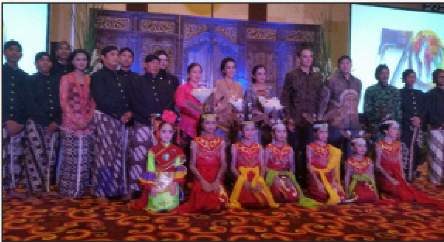
Subud Indonesia 28th National Congress.

The Indonesian Congress continued with business sessions and activities including the re-election of Iwan Syamsudin for two more years.