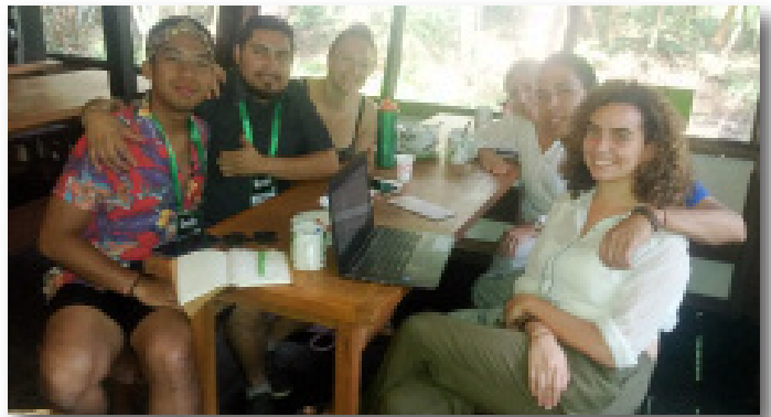
Our Subud Story Team in the KedungJati Café in Rungan Sari.

Our project website will display the stories in different categories, and will help satisfy a need for belonging and connection among members. An upcoming BOOK will further compile these stories into a physical format.