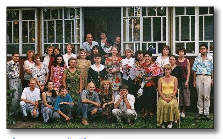
Scenes from community life in Subud Ukraine.