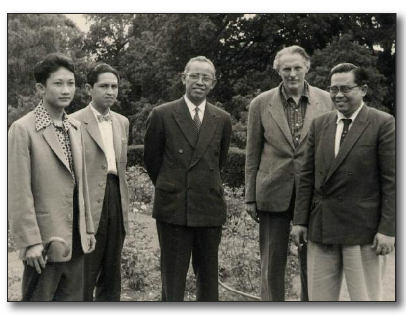
Sixty years since Bapak first came to the UK.

I was unable to hear much of what was said at the meetings, but I did gather a few things of interest that may be worth passing on.