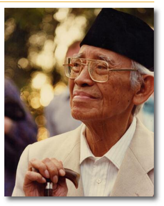
Bapak.

A year or two later I snuck in with a bunch of people who were seeing Bapak before going back to their homes. "And where are you going?" he asked me. "I'm going to America