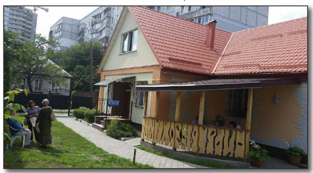
ended up coming to the The Cherkassy Subud House. How it looks now, after the installation of heat in-Subud workshop and sulation of its walls and other external jobs, which we were able to afford solely being interested in the thanks to grants from MSF.

My introduction went for six or seven minutes, with translation. But before I made this short talk, I already felt some light energies. In fact, as particular people took their seats in the audience, I felt several times an impulse inside. As you might expect, these were the people who ended up coming to the being interested in the latihan.