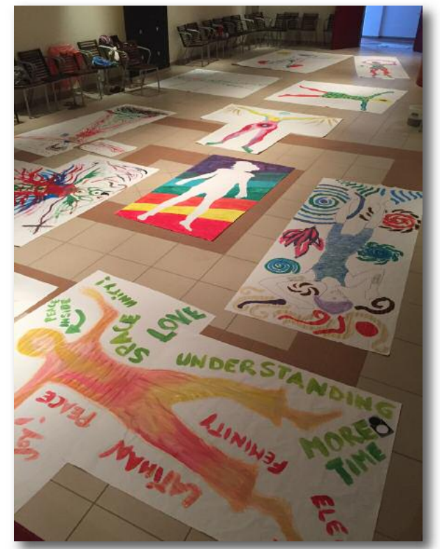
Art work from the creativity workshop.