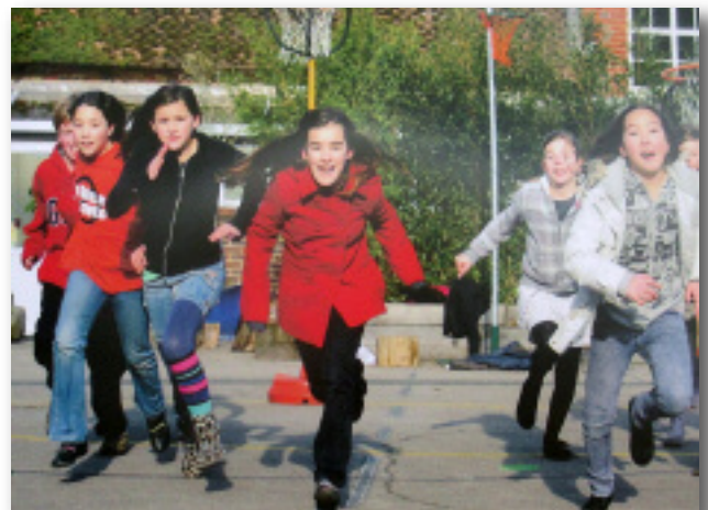
Susila Dharma English-teaching project in Moldova. One of many projects displayed at Congress.

For World Congress Part 2 see October's edition