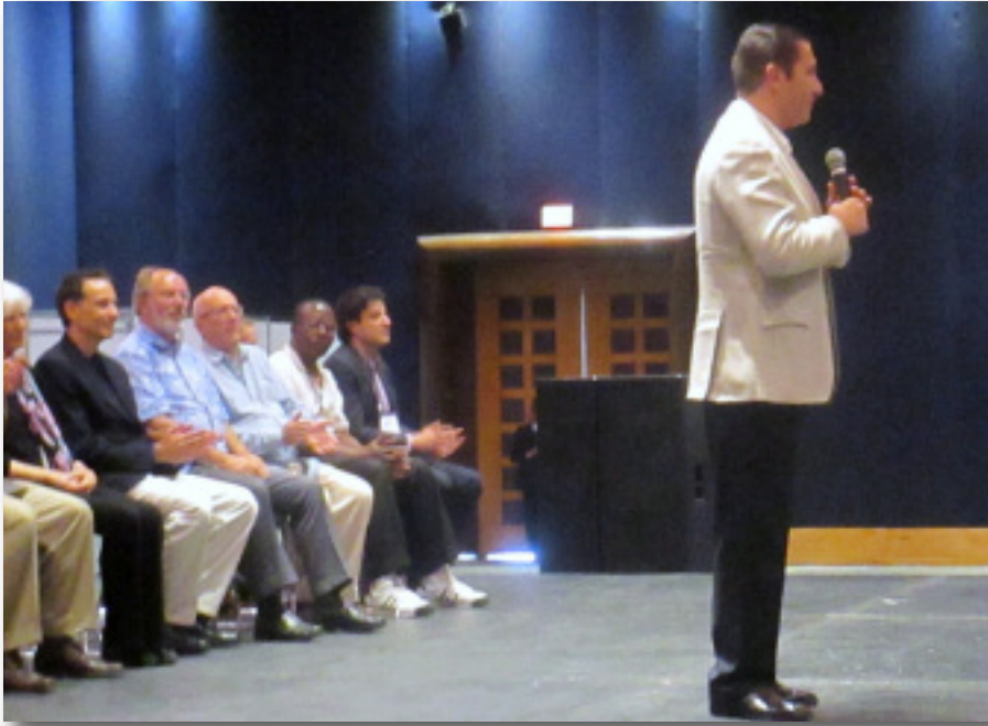
Dr. Rafael Moreno Valle, Constitutional Governor of the State of Puebla, attended the opening of Congress.