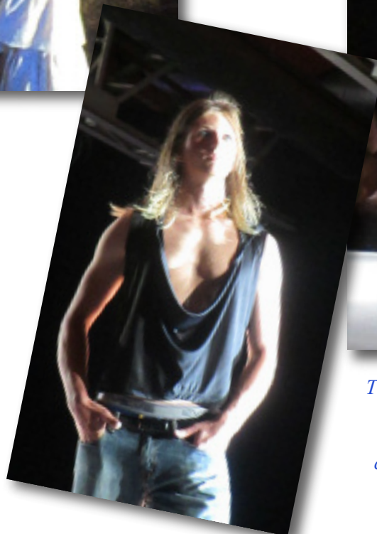
Male fashion was included.

Made from recycled materials, they combined circus, punk and space age motifs in an exciting way.