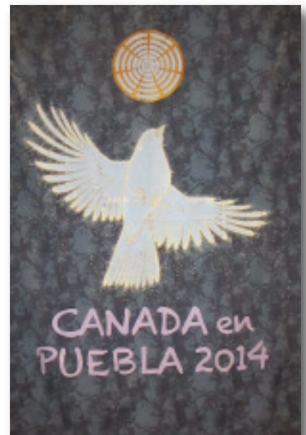
The Banner from Canada.