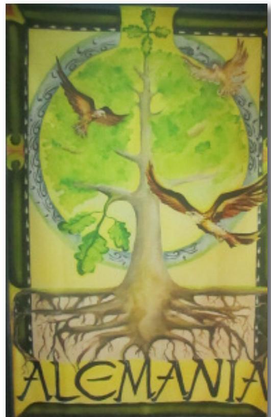
The final banner designed by Rusydah Ziesel.