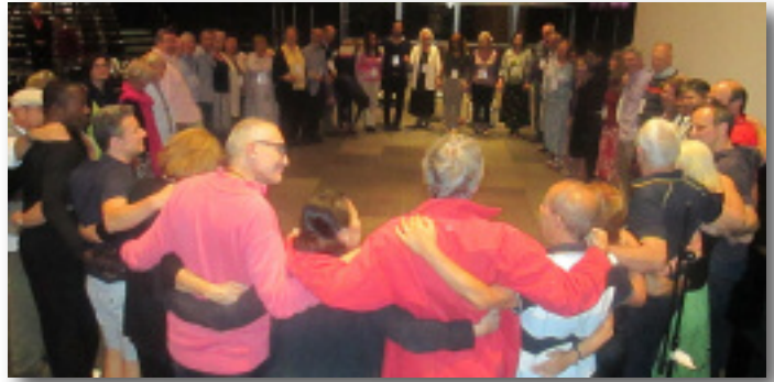
"We made it!" Delegates share a celebratory circle hug at the end of Congress.

Many people, including delegates themselves, wondered why it all took so long. This comes up at every Congress. Isn't there some way to make the process of dealing with business quicker and easier? This is a frequently heard cry.