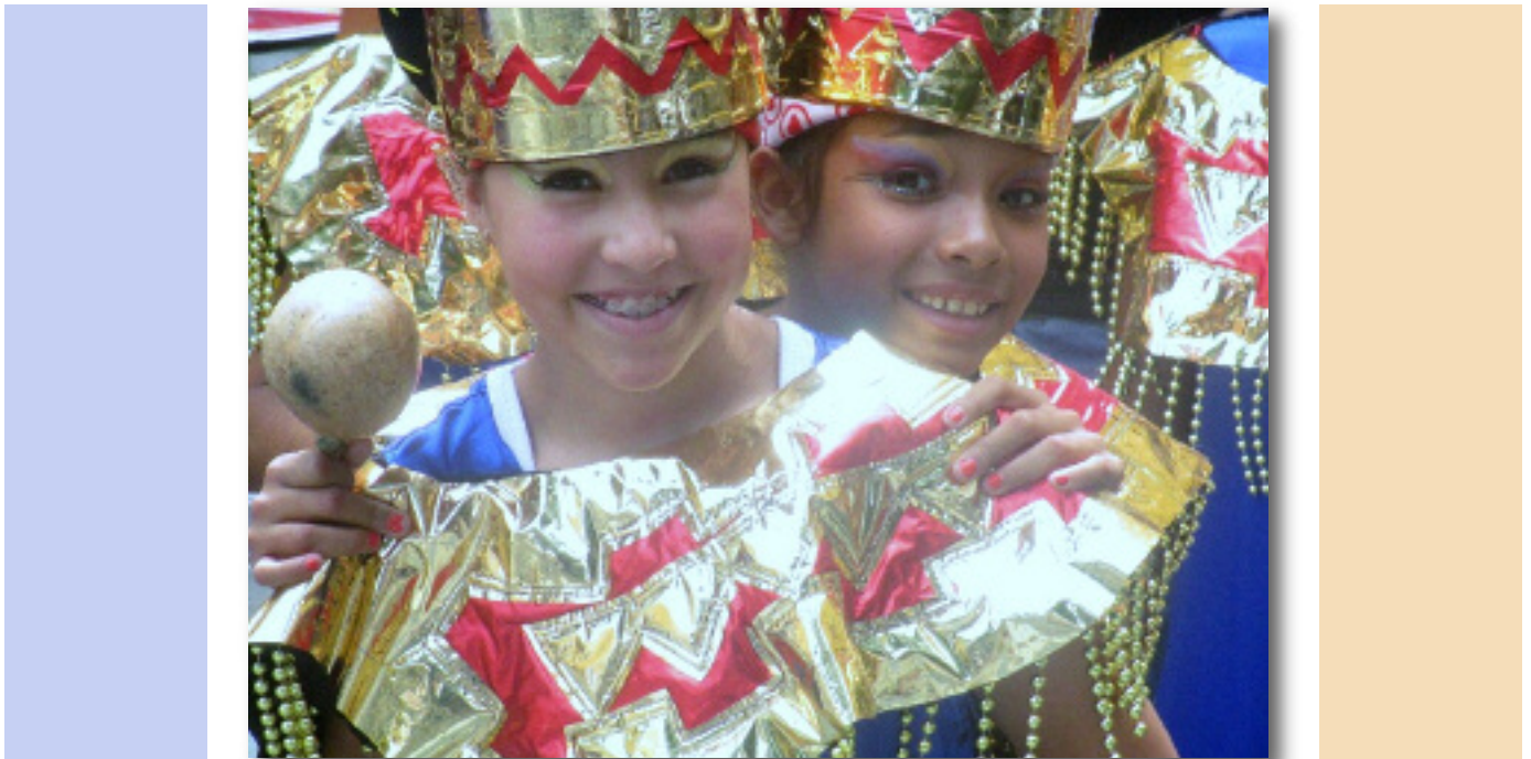
Puebla welcomes us.

The 2014 Subud world Congress in Puebla August 3-17 was a great success. Firmly founded on the latihan, it was an explosion of colour and vitality in every sphere of life