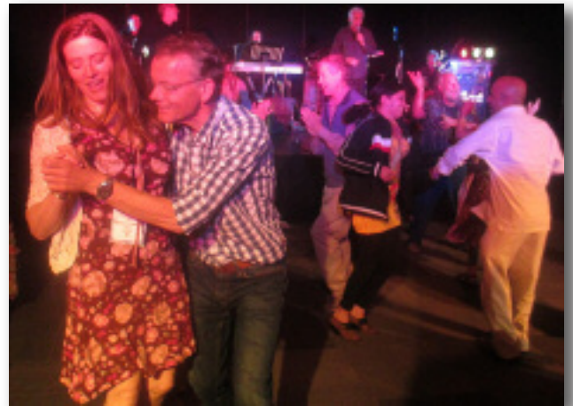
At the close of the Susila Dharma Gala Evening. Not only compassion, but also joy.