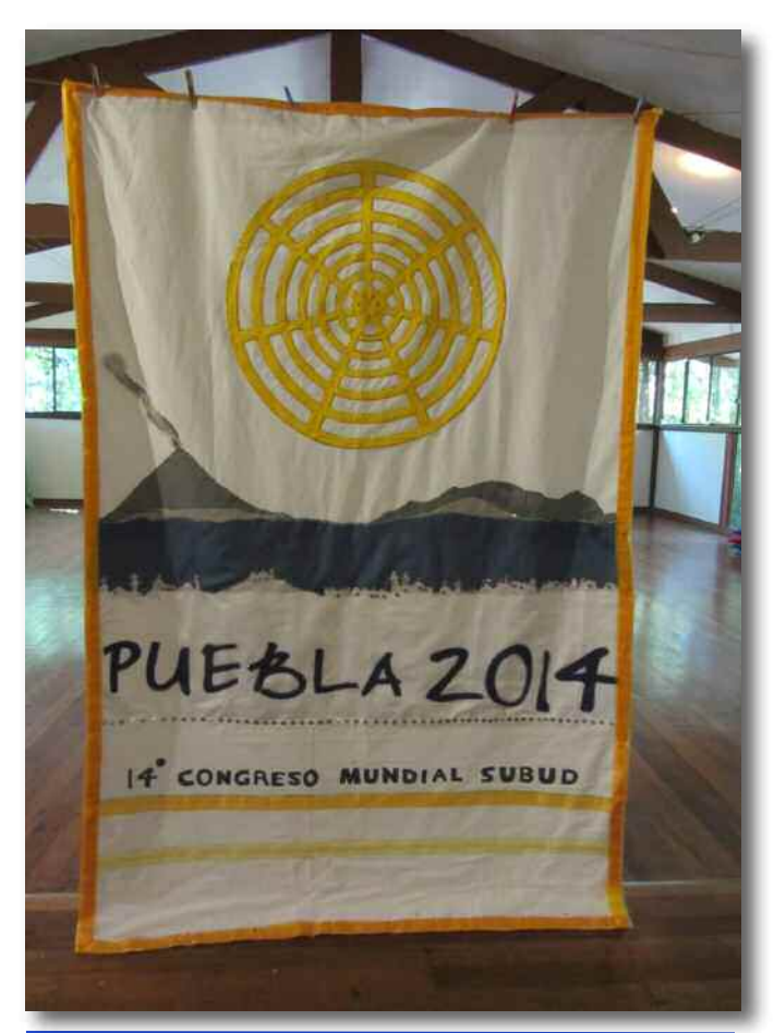
< World Congress banner.