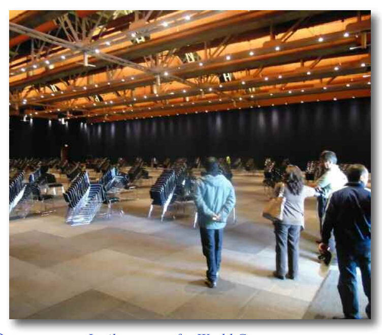
Latihan space for World Congress.