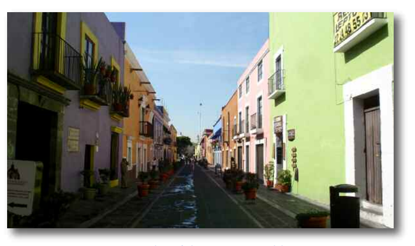
Colourful street in Puebla.

DISCOUNTS: Contact via Email Halimah, swcdiscounts@gmail.com