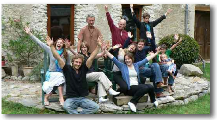
A previous YES Quest at La Source, France.

This is a fantastic opportunity to travel to Mexico and participate in the Yes Quest and the World Congress. The Quest will run for 7 days in Puebla before Congress (July 26 to Aug 2), and 4 days after >