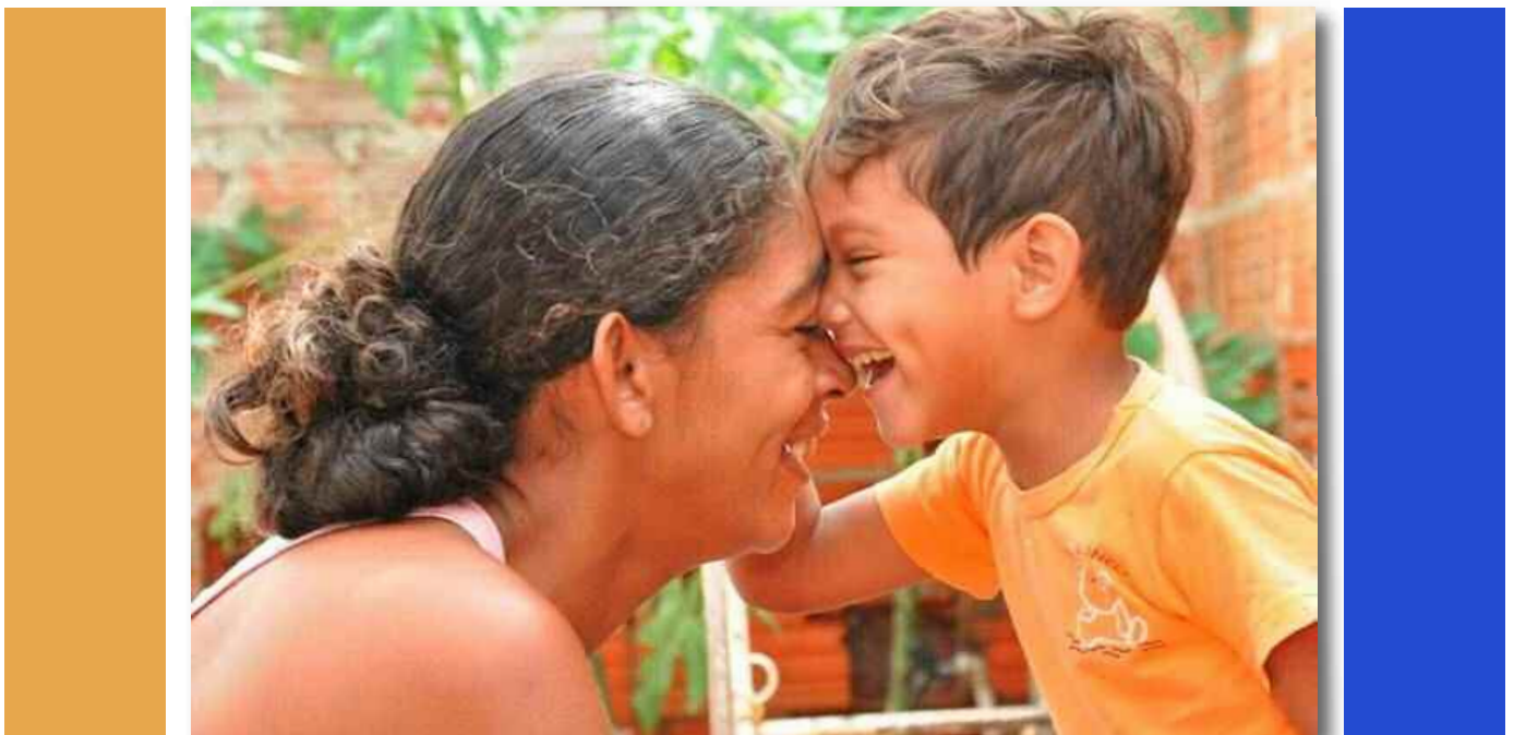
ICDP in Brazil

The ICDP November 2013 Newsletter contains articles received between March and November 2013. It gives a most interesting and impressive picture of ICDP's activities in many countries around the world. Here we publish an edited selection of just a few of the articles. To obtain the complete Newsletter contact lailah@icdp.info