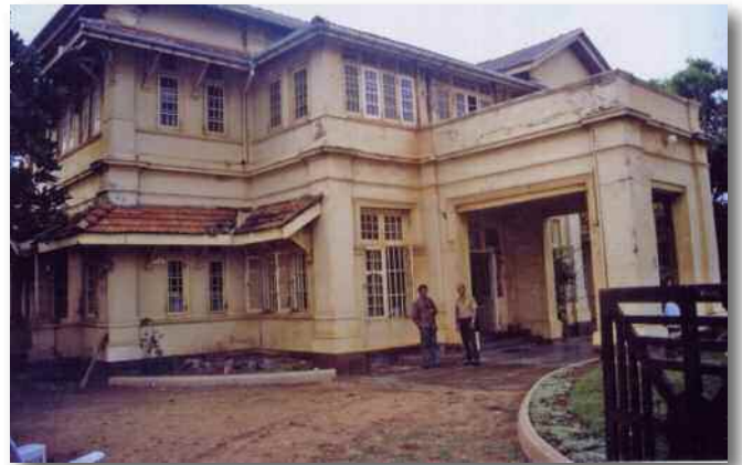
The original Sri Lankan Subud House...