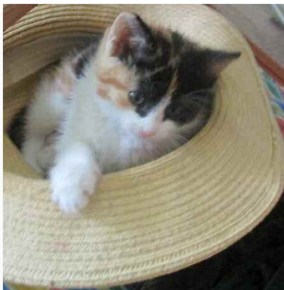
My cat Biscuit.

Of course, she is lacking in certain respects. It is not possible to have an in-depth discussion with her about books and films, or to gossip with her about our friends. On the other hand she never criticises me, appearing to accept me exactly as I am, and has never yet uttered those ominous words, “We must talk.”