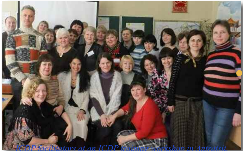
ICDP facilitators at an ICDP training workshop in Anratsit

The future plan is to continue applying ICDP at the Early Intervention Centre and to establish the ICDP approach in five of the ten preschools where ICDP has already been introduced in a more general way.