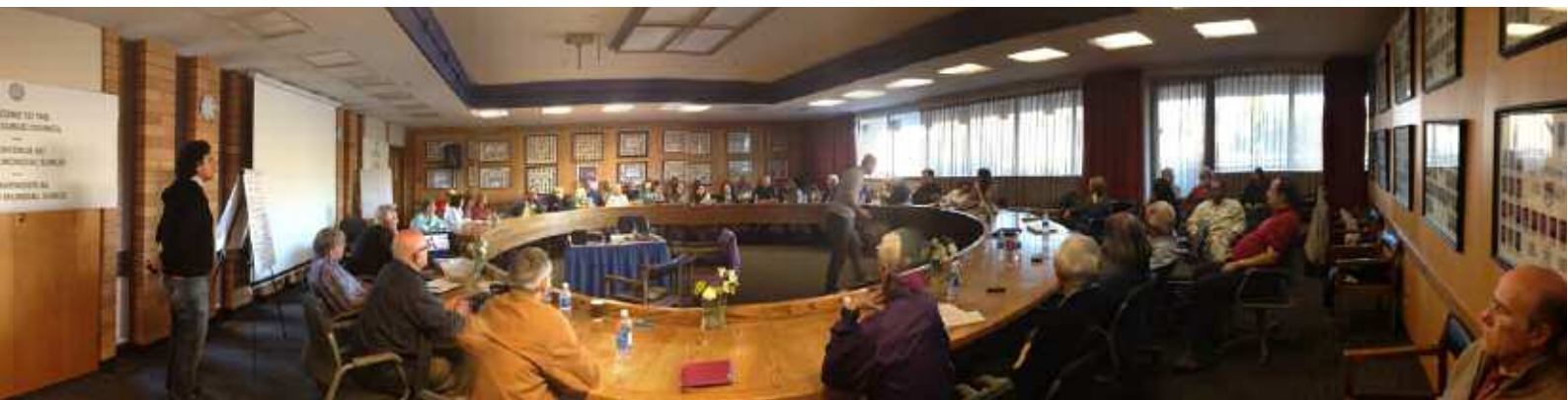
The World Subud Council in Vancouver.